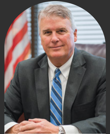
MAYOR SKIP HENDERSON