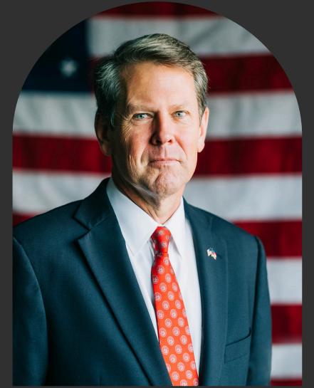
GOV. BRIAN KEMP

The City of Columbus placed the area where Elliott's Walk is in a Columbus Tax Allocation District (TAD). This allows for future property taxes to pay for the infrastructure development required for the housing units.