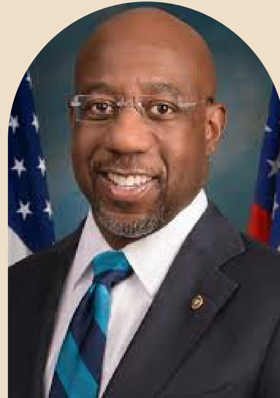
SEN. RAPHAEL WARNOCK

We have also received American Rescue Plan funds from the City of Columbus to support pre-development costs, and this project will be completed in partnership with the Housing Authority of Columbus.